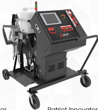
Patriot Innovator III Injection System (with PLC)