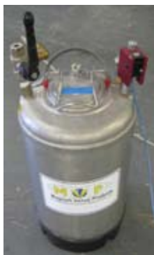
Level Sense for Catalyst Tank