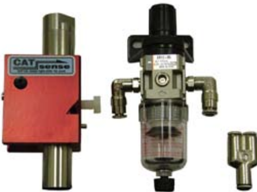
Cat Sense Installation Kit

When it comes to safely and accurately sensing catalyst flow, Cat Sense is the tool the market has been looking for.