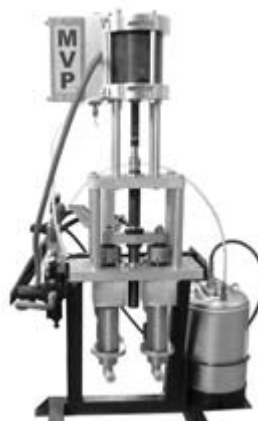
Duo 1:1 Proportioner Pumps

Stainless Steel Transfer Pumps & Proportion Pumps