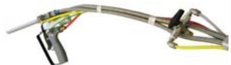
1:1 Pro Gun with Flush Controls