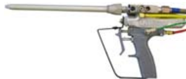
1:1 Pro Gun - Adhesive Configuration